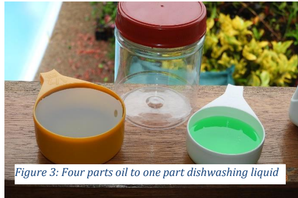
Figure 3: Four parts oil to one part dishwashing liquid