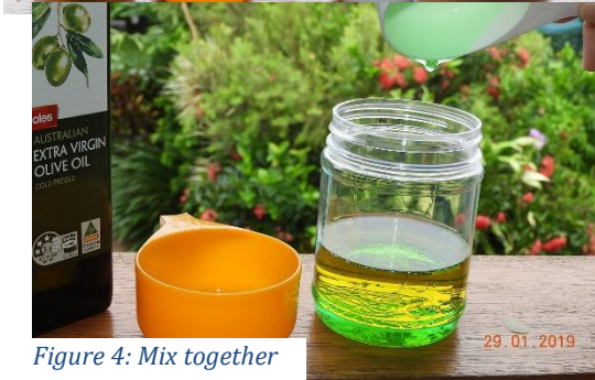
Figure 4: Mix together