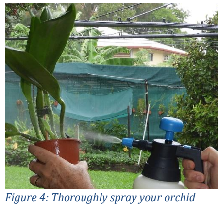
Figure 4: Thoroughly spray your orchid

Step 7: Place the orchid in a non-sunny spot and ignore it. The hard scale will all be smothered (killed) shortly - although they will not disappear. You can wipe the now-dead scale off the next time you repot.