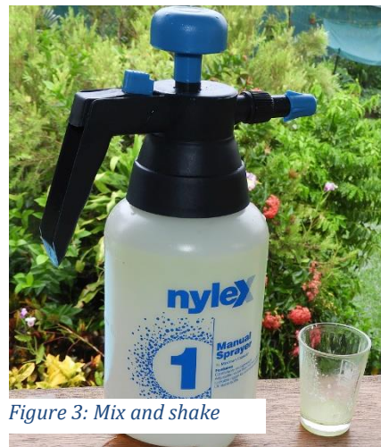
Figure 3: Mix and shake