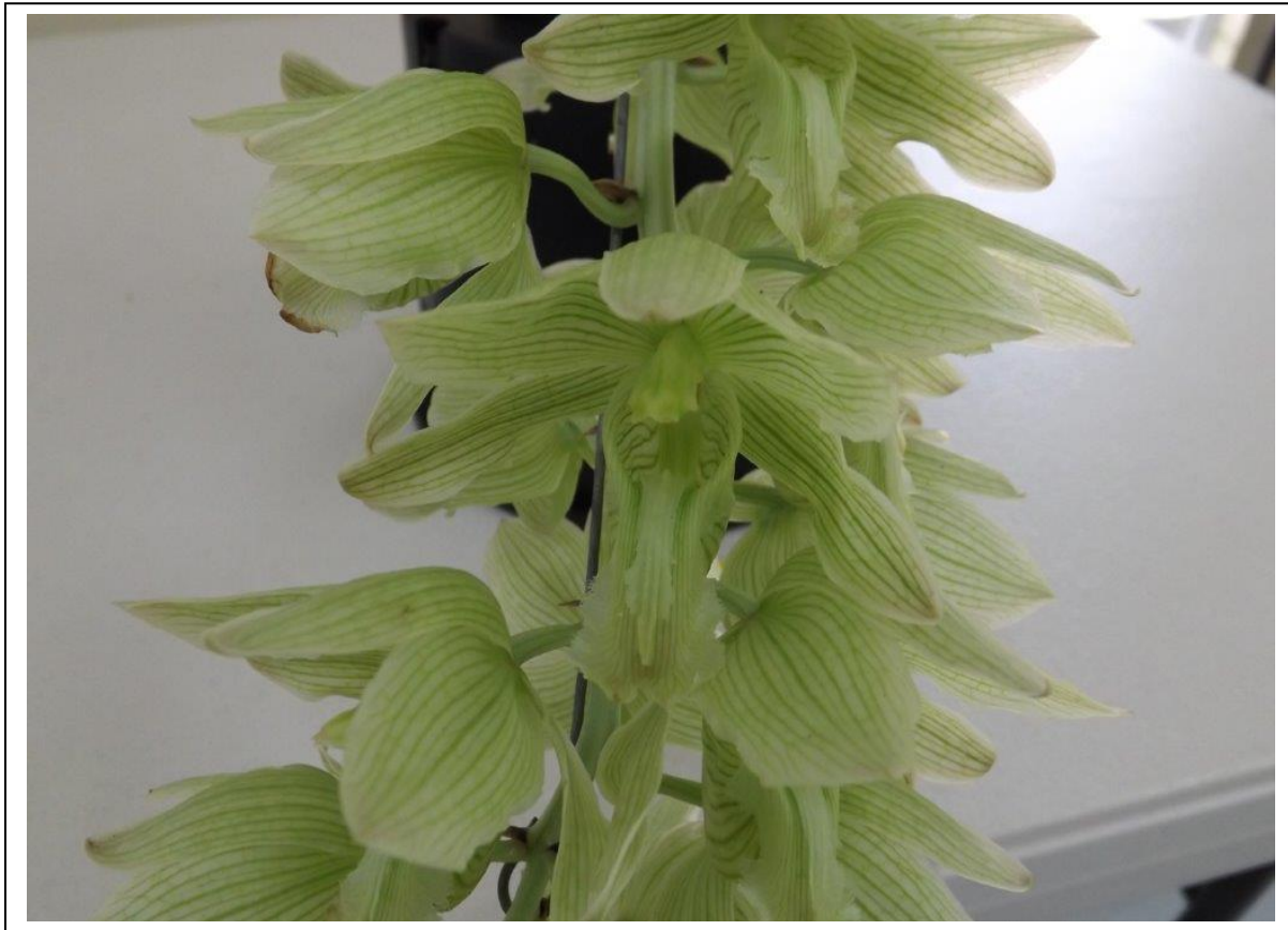
Species Ctsm russellianum 81 pts R & E Dundas