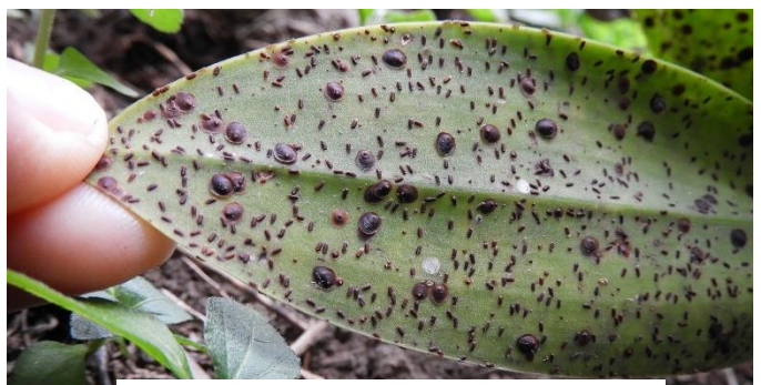
Figure 1 Hard scale on a Laeliinae orchid leaf.

Step3: Shake the living daylight out of the bottle – remembering to screw on the lid first.