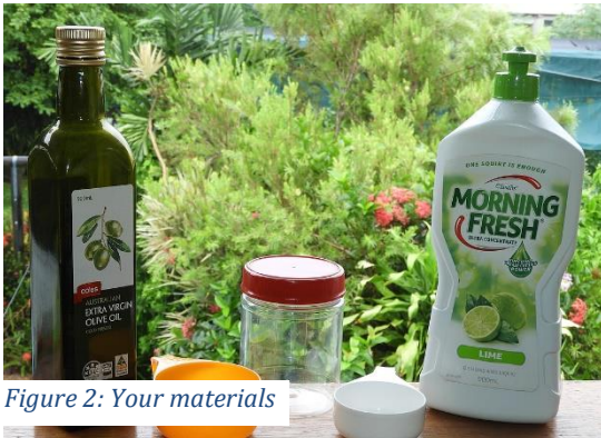
Figure 2: Your materials