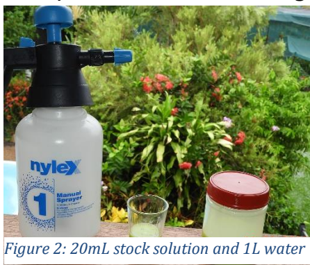
Figure 2: 20mL stock solution and 1L water

Step 5: Shake the heebie-jeebies out of the sprayer. Need I mention that you should only do this after screwing on the lid.