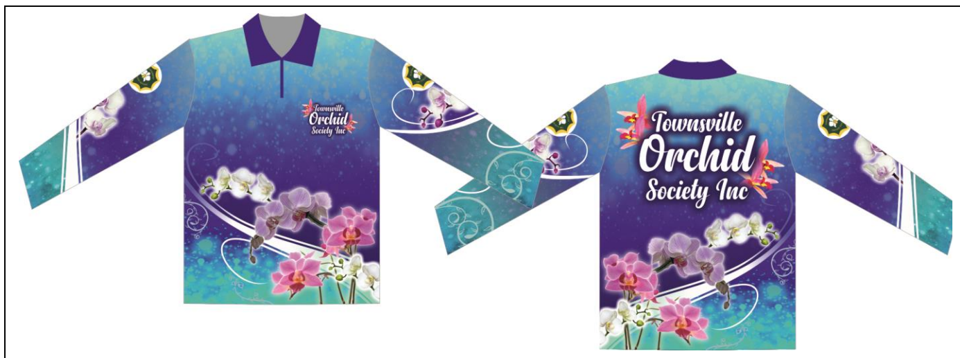
Shown above: Blue/Teal

At the February meeting, it was decided to proceed with new T-shirts, as shown below: