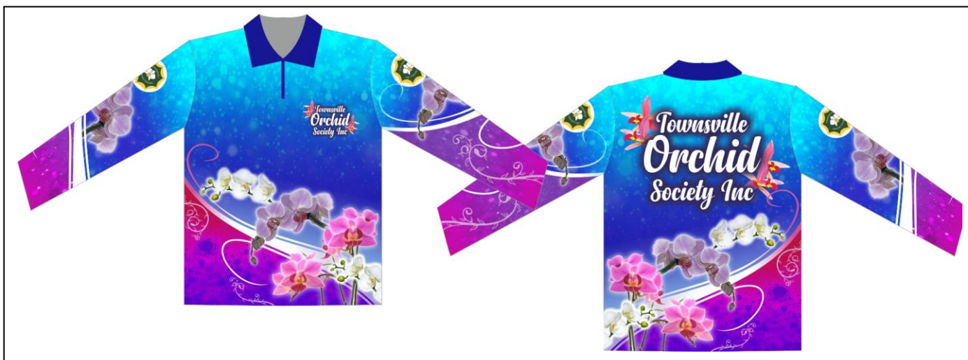
Shown above: Blue/Purple