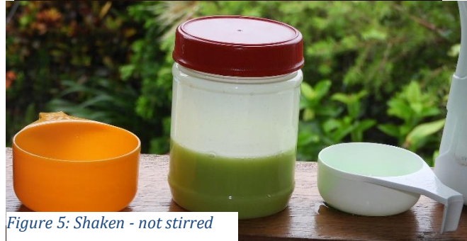
Figure 5: Shaken - not stirred